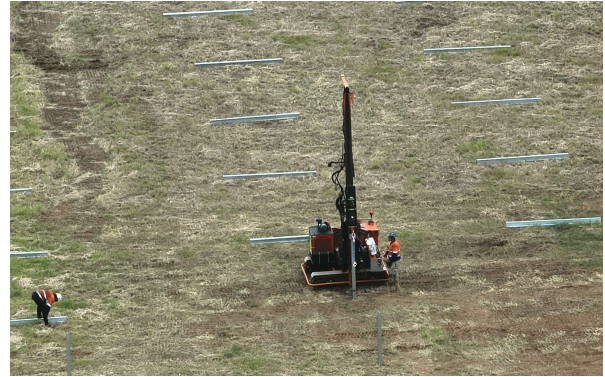
Commencement of Piling – 12 th March 2025

The Golden Rows are the standard for which the solar farm will be constructed. This represents a significant milestone for the project.