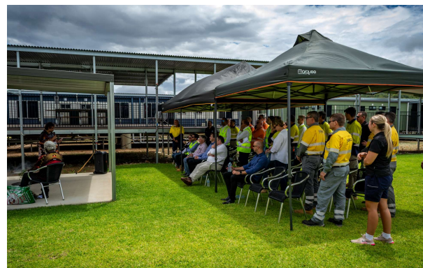
Welcome to Country and Smoking Ceremony – 11 th March 2025