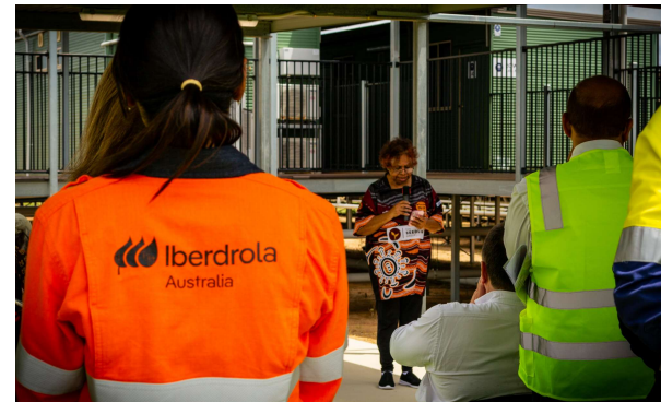
Welcome to Country – 11 th March 2025